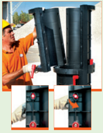
Handles lock the units into position with a 90° turn