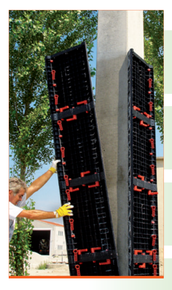
Geotub_____ Circular formers

Geotub Panel _____ Square/rectangular formers